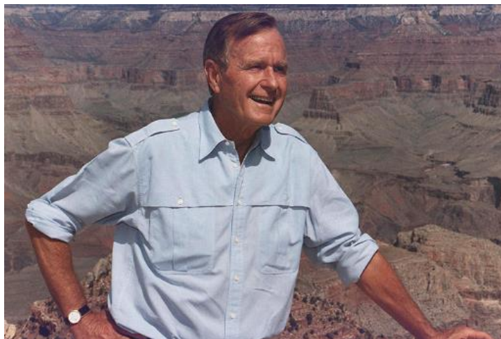
President Bush goes for a hike on the Kaibab Trail at the Grand Canyon in Arizona, September 18, 1991.

This is the third of our Environmental Awareness Series. The upcoming topic is the Antarctic Protection Act.