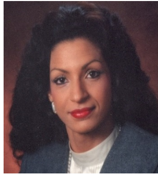
The Honorable Teta V. Banks