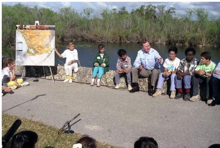
President Bush visits Everglades National Park and participates in a discussion with sixth grade students involved in the National Parks Service Environmental Education Program. January 19, 1990

This is the second of our Environmental Awareness Series. Upcoming topics include: Wildlife Refuges and the Antarctic Protection Act.