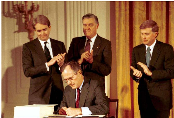
President Bush signs the Clean Air Act Amendments, East Room of the White House. November 15, 1990

This is the first of our Environmental Awareness Series. Upcoming topics include: The N.A. Wetlands Conservation Act, Wildlife Refuges, and the Antarctic Protection Act.